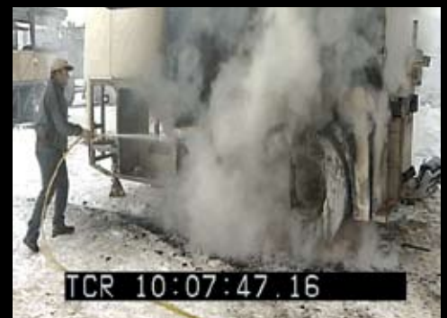
Approximately 44 seconds, deep seated fire is suppressed