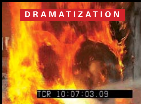
Example of a deep seated fire

While firefighting should be left to the professionals, the system is designed to help minimize damage before the firefighters arrive.