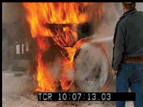
Approximately 10 seconds after the system is activated suppressing the fire